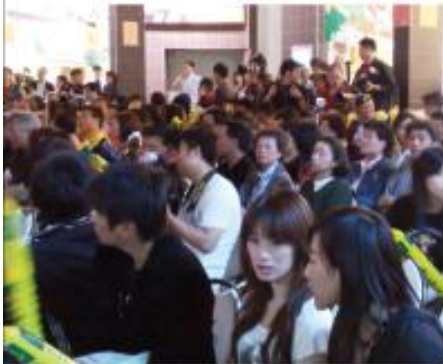
A1 Cover Girl Contest

Excellent Promotional Power and Quality Programming A1出品 信心保證