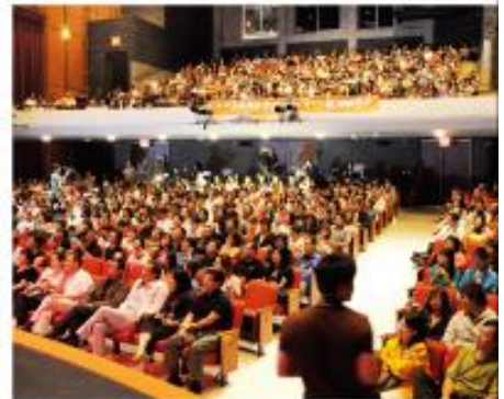
A1 Sing-alike Karaoke Contest