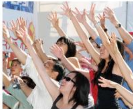
A1 show at CHIN PICNIC